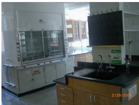
Research Laboratory in the newly renovated northeast wing